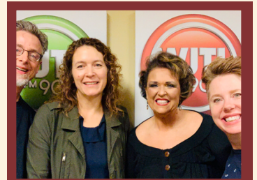
Thank you WJTL for promoting the National Day of Prayer for Mental health awareness, and Faith Friendship Ministries as the sponsor of the event.